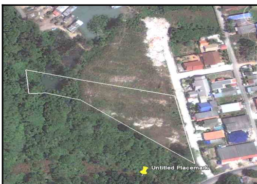
Aerial of the new property.

SHE has leased 3 rai (1.5 acres) of land for a 10 year period (see Figure 8); this lease is registered with the Thai government here in Phuket and can be renewed with the offer of more land if required in the future. The land price is 15,000 Baht per month for the first 5 years starting on November 2010 and increases to 20,000 Baht for the remaining 5 years. The buildings will be constructed using concrete frames, as this is the cheapest alternative (all fittings can be moved in the future if needed). We will be incorporating natural local replenishable materials such as bamboo, coconut wood, etc where possible.