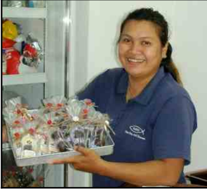
Displaying SHE Candies

The name SHE stands for ‘Self Help & Empowerment’. This is not only our objective for the people we train but also for SHE as a foundation.