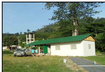
First building on site with pathways.