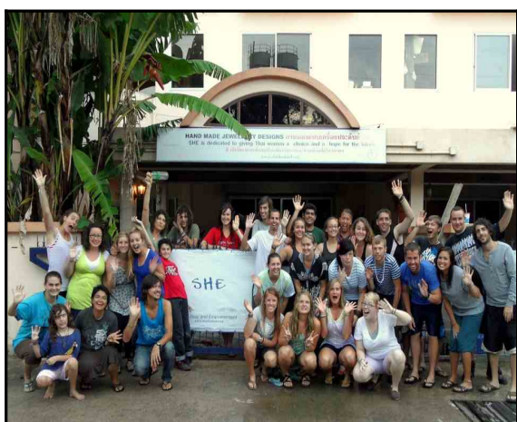
One of the visiting teams.

Over the past 5 years, SHE has built up a reputation as being a good location for teams to come and volunteer. Every year the amount of volunteers we host at the Centre continues to grow and we predict that within the next 2 years we will outgrow our premises for the 3rd time. In 2010, SHE hosted 24 short term teams who have stayed with us for 2 weeks to a month. In 2011, we have hosted over 450 people.