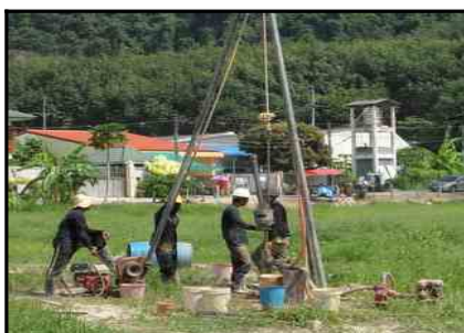
Soil testing for foundation design.

SHE will contribute project management and volunteer labour throughout the construction phase and continue to manage the programmes after completion.