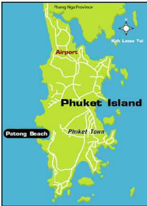
Map of Phuket, Thailand

Patong beach is situated on Phuket's west coast and is the main tourist resort in Phuket. It is also one of the main locations in Thailand for the commercial sex trade. Although Prostitution in Thailand is illegal, in practice it is tolerated and partly regulated. Prostitution is practiced openly throughout the country. Local officials with commercial interests in prostitution often protect the practice. The trafficking of women and children for prostitution is a serious problem. The precise number of prostitutes is difficult to assess and estimates of the number of prostitutes vary widely and are subject to controversy, but in 2004, Dr. Nitet Tinnakul from Chulalongkorn University found a total of 2.8 million sex workers, including 2 million women, 20,000 adult males and 800,000 minors under the age of 18. Although centers such as Bangkok, Pattaya, and Phuket (Patong) are often identified as primary tourist "prostitution" areas prostitution takes place in nearly every major city and province in the country.